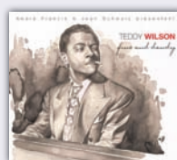
CMJ274161314 | 794881895021 | CD2 Jazz Characters Vol. 47 Teddy Wilson 'Fine And Dandy'