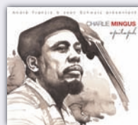
CMJ274160910 | 794881894925 | CD2 Jazz Characters Vol. 45 Charlie Mingus 'Epitaph'