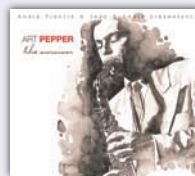
CMJ274160506 | 794881894529 | CD2 Jazz Characters Vol. 43 Art Pepper 'The Survivor'