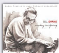
CMJ274161516 | 794881895120 | CD2 Jazz Characters Vol. 48 Bill Evans 'Sunday In Spring'