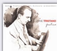
CMJ274161718 | 794881894727 | CD2 Jazz Characters Vol. 49 Lennie Tristano 'Pastime'