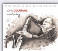
CMJ274161920 | 794881895229 | CD2 Jazz Characters Vol. 50 John Coltrane 'Mister Day'