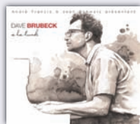
CMJ274160708 | 794881894826 | CD2 Jazz Characters Vol. 44 Dave Brubeck 'A La Turk'