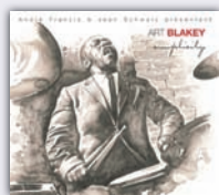
CMJ274161112 | 794881894628 | CD2 Jazz Characters Vol. 46 Art Blakey 'Simplicity'